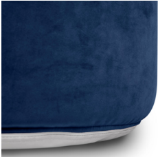
Handy non-slip bottom