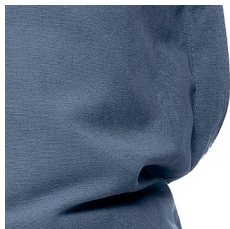
Super strong high quality fabric