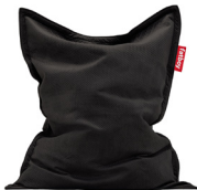
Made from recycled materials