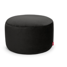
Made from recycled materials