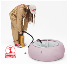
Easy to inflate