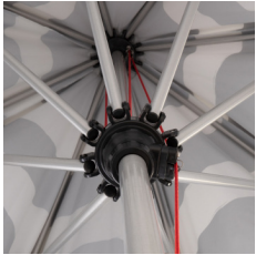
Quick release mechanism